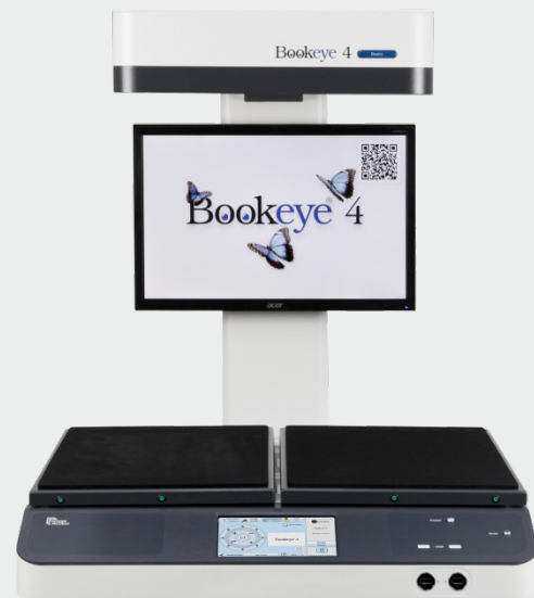
Front view of the Bookeye® 4 V2 Basic.